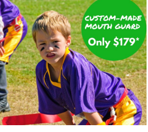
Kids check-up & Clean

*Offer includes: premium custommade mouthguard using a single "blank" and case